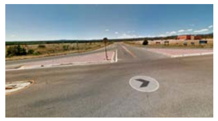
Looking west towards Cochiti Pueblo across New Mexico 22 Intersection 12.2

Originally known in the Keresan language as ko-tyīt', Pueblo de Cochiti is New Mexico's northernmost Keresan-speaking pueblo, and has a current total enrollment of 1,465 tribal members.