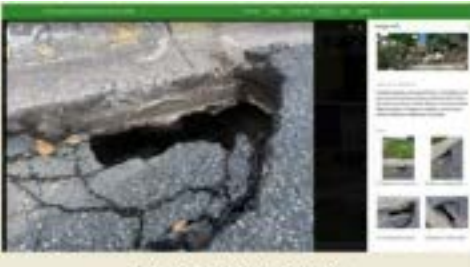
Fiemplo de dato recolectado

Securipción del exente según cisoladores que subili la foto. "Cumilo regresi a nel caso el lunes. Fabilidas esa percotorios que tay un hejo executamente freche o nel caso. El un hejo bosdo desde la comenza cadió. Rey palignos. Salaque un cefacios projeto para exister excidentes. Aproduces su opusi-