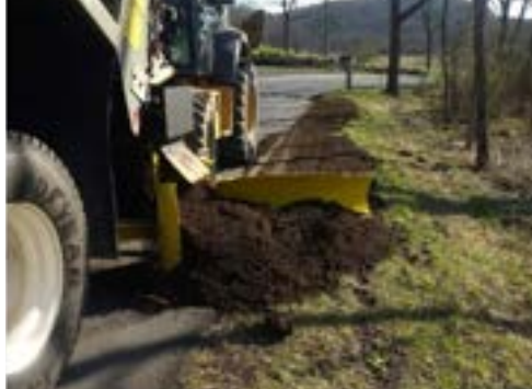
INNOVATIVE PROJECT AWARD: South Manheim Township, Schuylkill County (PA) for the 'Sidewinder', a truck attachment tool to improve the maintenance of water flow along the roadways.